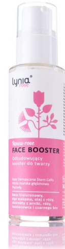
RENEW ROSE BOOSTER

Rose cream from the Renew Rose series is an innovative formula that gives the skin intensive reconstruction, nourishment and regeneration. It has a soothing and calming effect, protects fragile blood vessels and renews the skin, providing deep hydration.