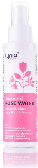
RENEW MINERAL WATER

Mineral rose mist is an innovative formula that will refresh, cleanse and regenerate your skin. It has soothing and calming abilities, protects fragile blood vessels and deeply moisturizes the skin. The mist replenishes minerals and microelements and enhances skin's oxidation level. It restores correct pH and makes the skin cleansed, radiant and fresh.