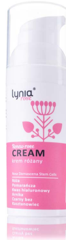
RENEW ROSE FACE CREAM

Renew Rose Face Serum stimulates regeneration processes, deeply nourishes and moisturizes, giving the effect of a lifted and healthy skin.