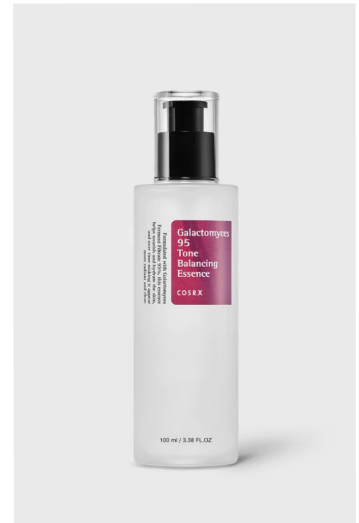
Galactomyces 95 Tone Balancing Essence