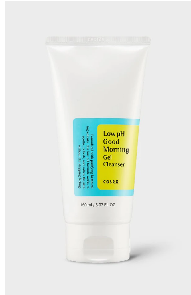
Low pH Good Morning Gel Cleanser