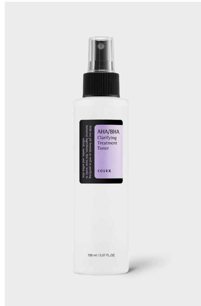
AHA/BHA Clarifying Treatment Toner