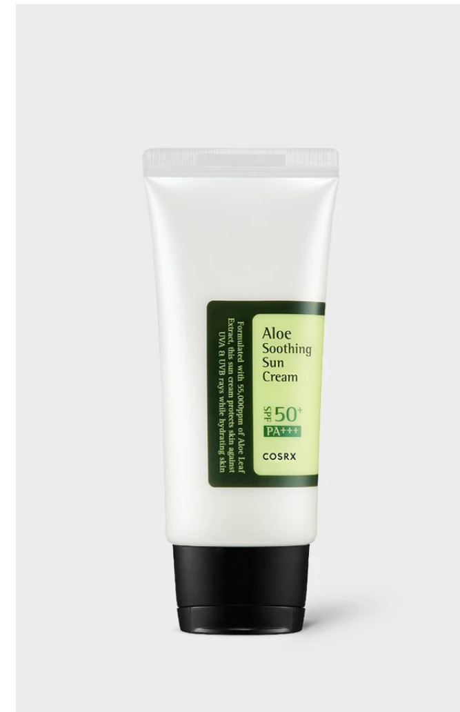
Aloe Soothing Sun Cream SPF50+/PA+++