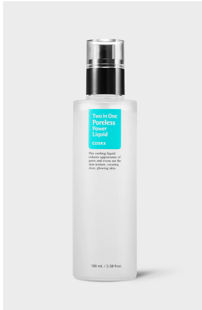
Two in One Poreless Power Liquid