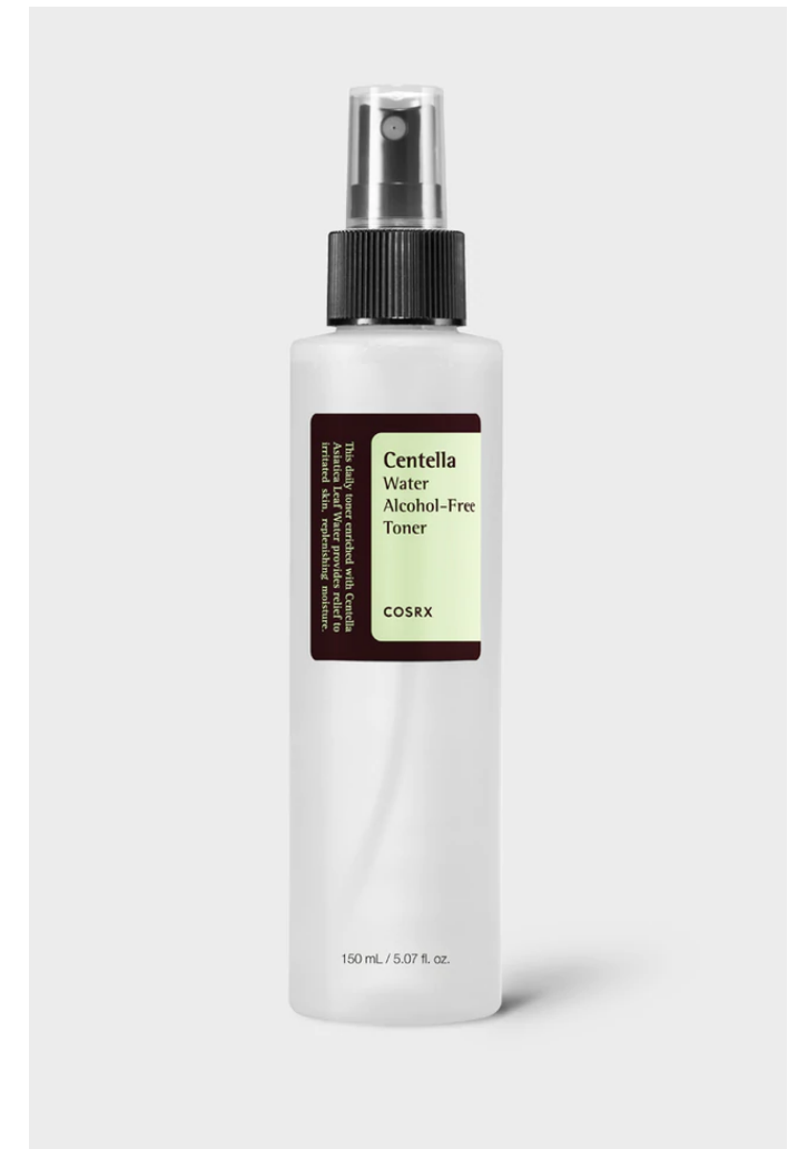
Centella Water Alcohol-Free Toner