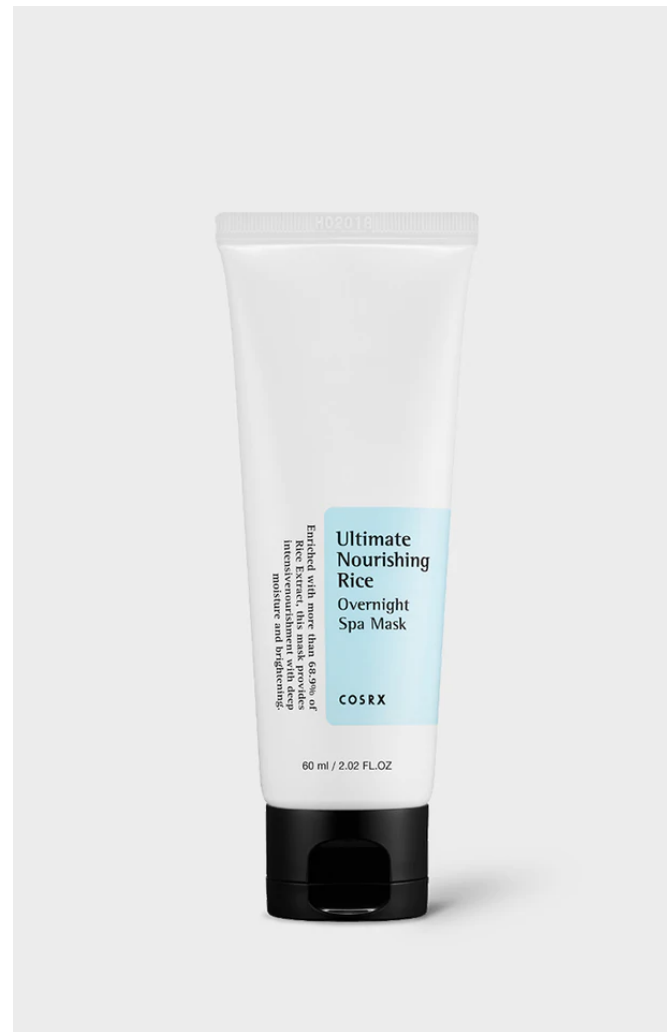
Ultimate Nourishing Rice Overnight Spa Mask