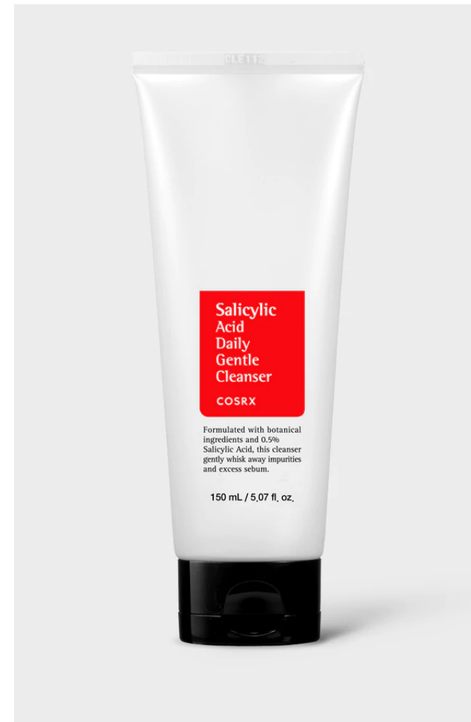
Salicylic Acid Daily Gentle Cleanser